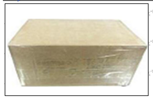
Pic No. 2 Domestic express packaging: Wrapped with Transparent tape