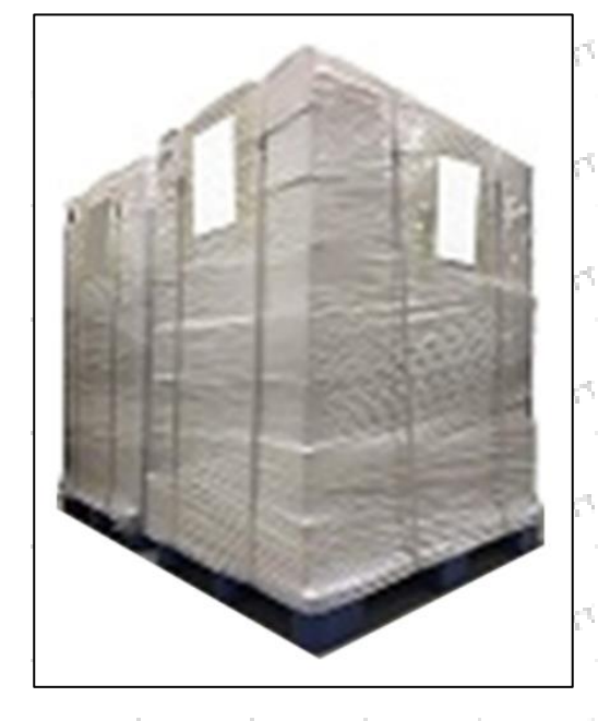
Pic No. 4

Pallet Shipping: Use pallet that meet export requirements, and use white wrapping protective film to wrap and bind with cable ties