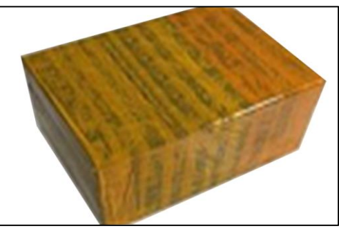
Pic No. 3 International express packaging: Wrapped with yellow tape after wrapping black protective film